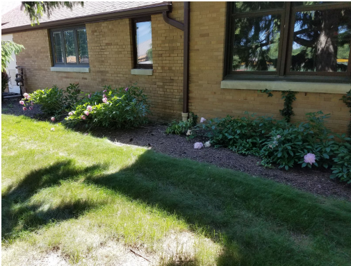
Peonies along East side of Church

(so you can see what you've been missing)