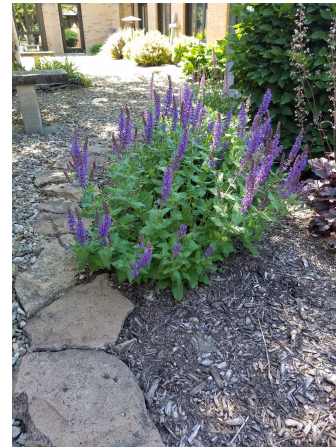
Salvia? In courtyard