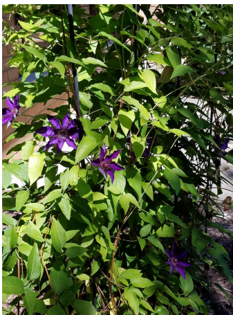
Clematis in courtyard