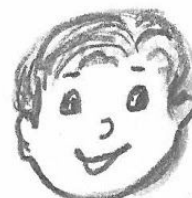
Henry-games, gym room